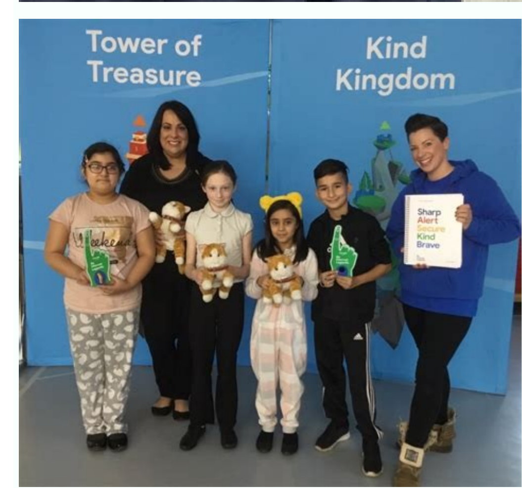
Boothroyd primary academy ofsted.